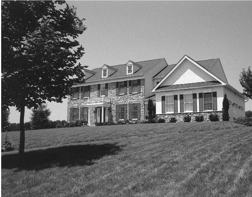
Curving driveways and side-load garages create a unique suburban design that hides vehicular accommodations.