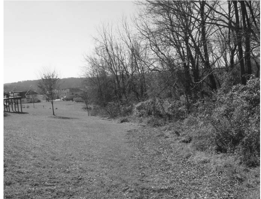
The walking trail at Brandywine River Estates allows residents to enjoy the areas of preserved open space.

The preserved open space is interspersed between the housing and also surrounds the perimeter of the tract. Much of the open space is preserved in its natural state, such as meadows, woodlands, and wetland. A circling trail provides a link for the residents to the open space as well as a source of passive recreation. Designed so as to not to be too intrusive, the trail is buffered from the back of the homes by planted evergreens where large setbacks were not feasible.